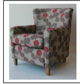
New Mokum Range

We have a lot of amazing new fabric ranges in our showroom. Mokum, Villa Nova, Royston House, Rasch and more arriving a the time. Plus the favourites James Dunlop, Warwick, Textilia, Irvine's and many more. A great choice of quality drapery and furnishing fabrics.