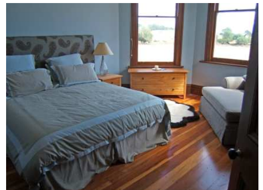
upholstered headboard, Bedroom furniture in rimu and an Armchair for two - all custom made.

This doesn't mean the items are expensive just that they are well made and fit exactly with your décor and needs. We deal with several furniture manufacturers who offer custom design to suit you and your budget. Everything from sofas and armchairs to dining room tables and bedroom suites.